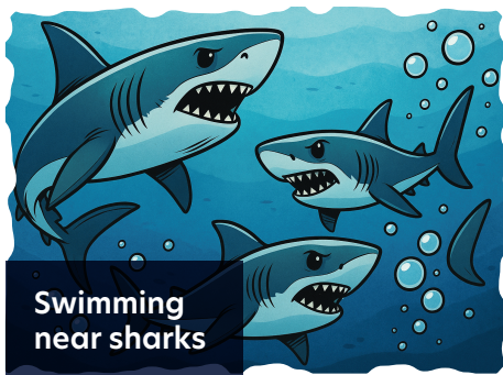
Swimming near sharks