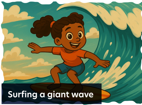
Surfing a giant wave