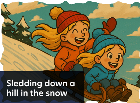
Sledding down a hill in the snow

What to Do: Print on paper and cut apart, one set for each Small Group.