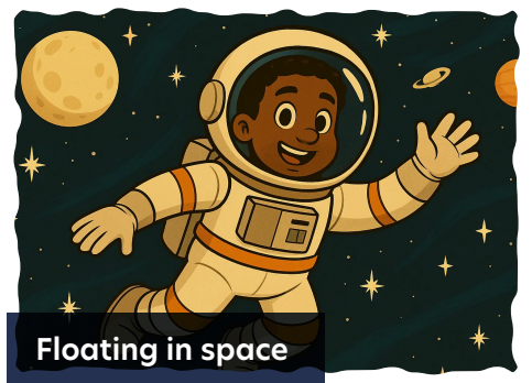
Floating in space