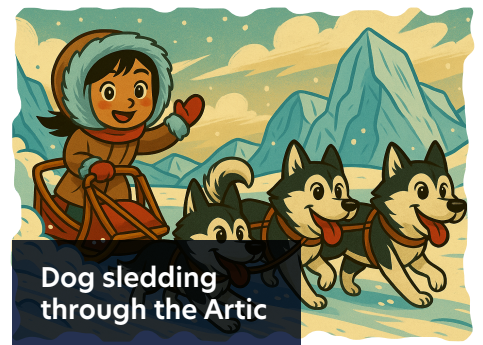
Dog sledding through the Arctic