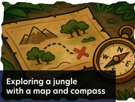
Exploring a jungle with a map and compass