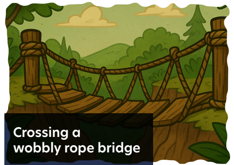
Crossing a wobbly rope bridge