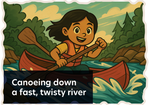
Canoeing down a fast, twisty river