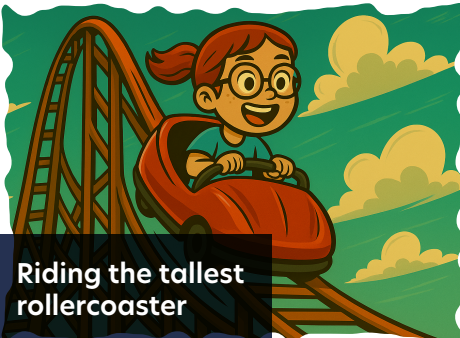
Riding the tallest rollercoaster