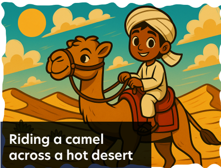
Riding a camel across a hot desert