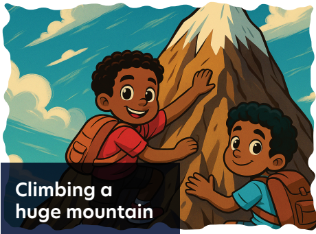
Climbing a huge mountain