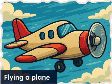
Flying a plane