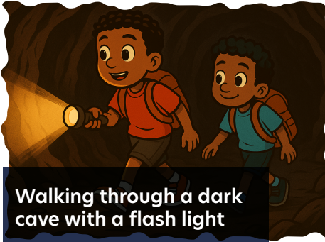
Walking through a dark cave with a flash light