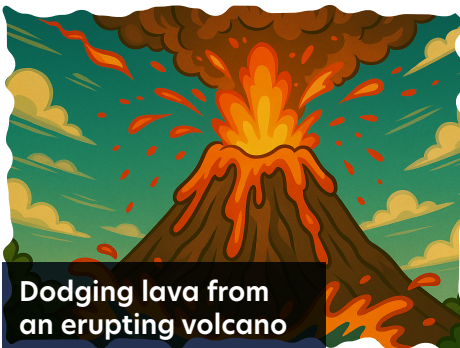
Dodging lava from an erupting volcano